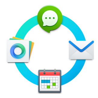
Synology Collaboration Suite

A modern file system designed to address obstacles often encountered in enterprise storage systems. Safeguarding data integraty through metadata mirroring, self-healing and snapshot replication.